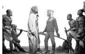
David Livingstone confronts arab slave traders