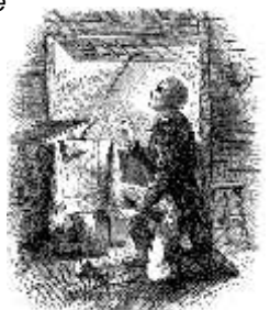
Judson Completing the Burmese Bible